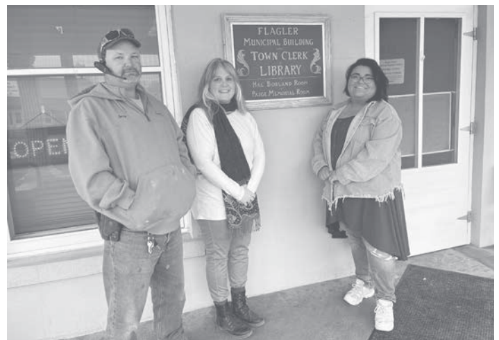
Representatives of the Town of Flagler pose for a photo at the Municipal Building.