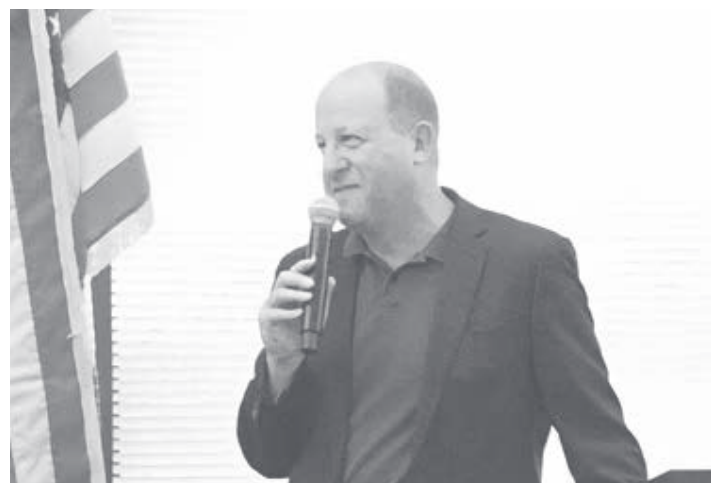
Colorado Governor Jared Polis makes remarks at the CML 100/25 anniversary celebration.