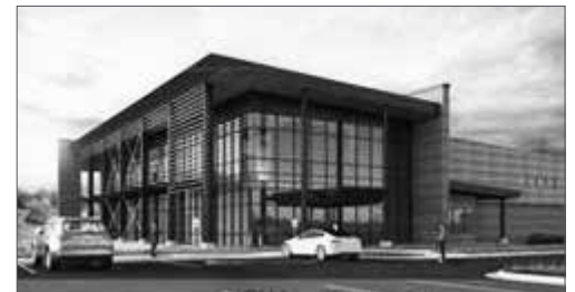
Drago's Mayfly Outdoors in Montrose.

Is your municipality experiencing increased economic activity from an Opportunity Zone in your community? CML would like to learn more about these projects and how they are impacting Colorado's cities and towns. Contact Morgan Cullen, CML legislative and policy advocate, with any details you can share at mcullen@cml.org .