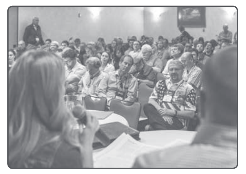
The CML advocacy team discusses the 2019 legislative session with attendees.