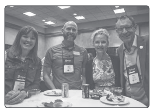
Attendees network with colleagues and refuel on delicious snacks during a session break.